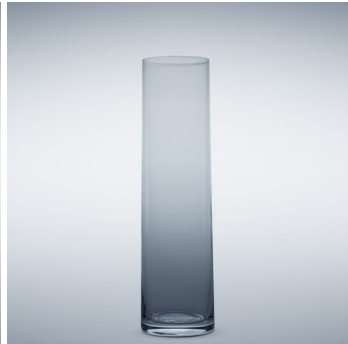
b 14 Beer slim 415 ml | 210 mm