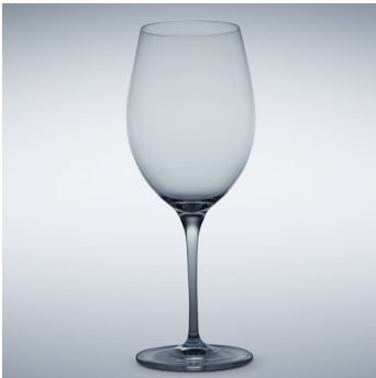
b 01 Bordeaux 620 ml | 240 mm