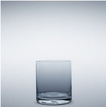
b 13 Whisky 480 ml | 102 mm 300 ml | 87 mm; 250 ml | 80 mm