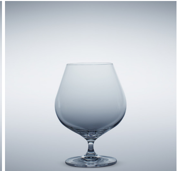
b 16 Cognac 780 ml | 156 mm