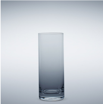
b 09 Highball 460 ml | 169 mm