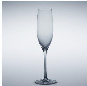
b 06 Sparkling 180 ml | 229 mm