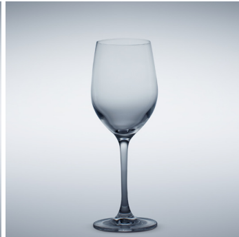
b 15 Chardonnay 340 ml | 210 mm