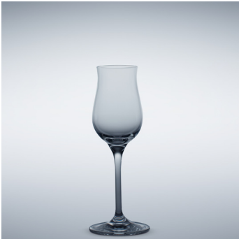
b 05 Digestive 125 ml | 182 mm