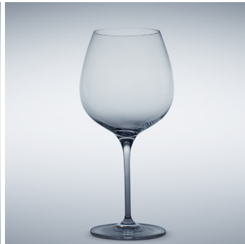
b 02 Burgunder 700 ml | 224 mm