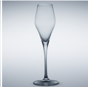
b 07 Cava 215 ml | 244 mm