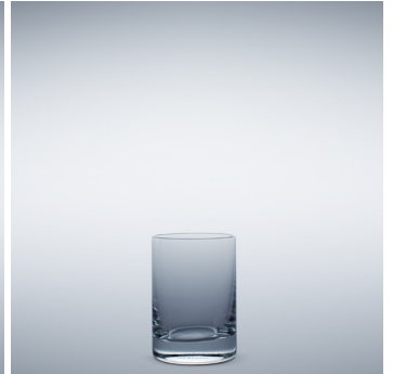
b 12 Water small 135 ml | 84 mm