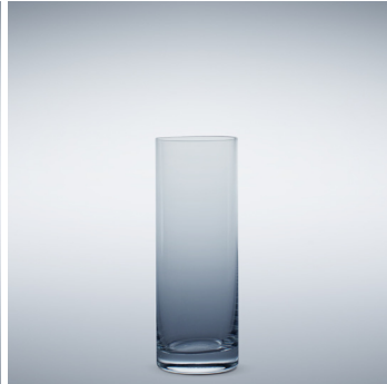
b 10 Longdrink 320 ml | 159 mm